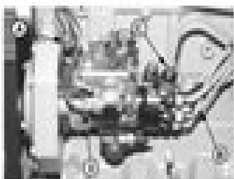
Fuel Lines: Return and Pressure Lines

A—Fuel Return Line B—Fuel Delivery (Pressure) Lines C—Fuel Supply Line D—Vented Line