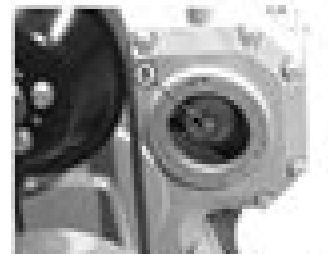
Pump Drive Gear Retaining Nut