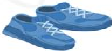
Put on shoes