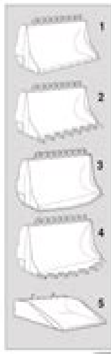
The five most common types of buckets