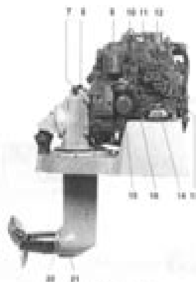
MD2010A/B & MD20