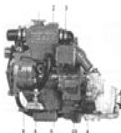
MD2010A/B & MD20