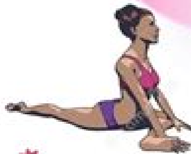
✿ Eka pada rajakapotasana