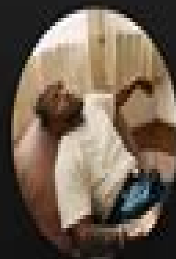
Kendrick Lamar Artist