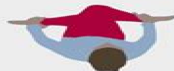
RECLINING COW FACE