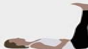
LEGS UP THE WALL