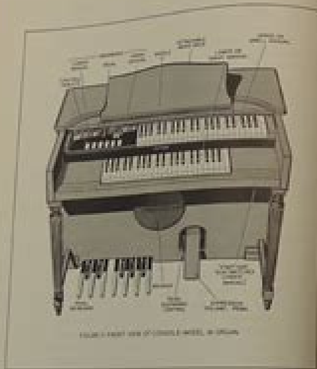
FIGURE 1 FRONT VIEW OF CONSOLE MODEL IN OPEN