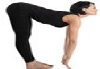
Standing Half Forward Bend