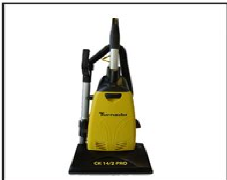
CK 14/1 PRO & CK14/2 PRO MODEL NO: 98147/98152