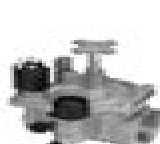
40mm (1 1/2")