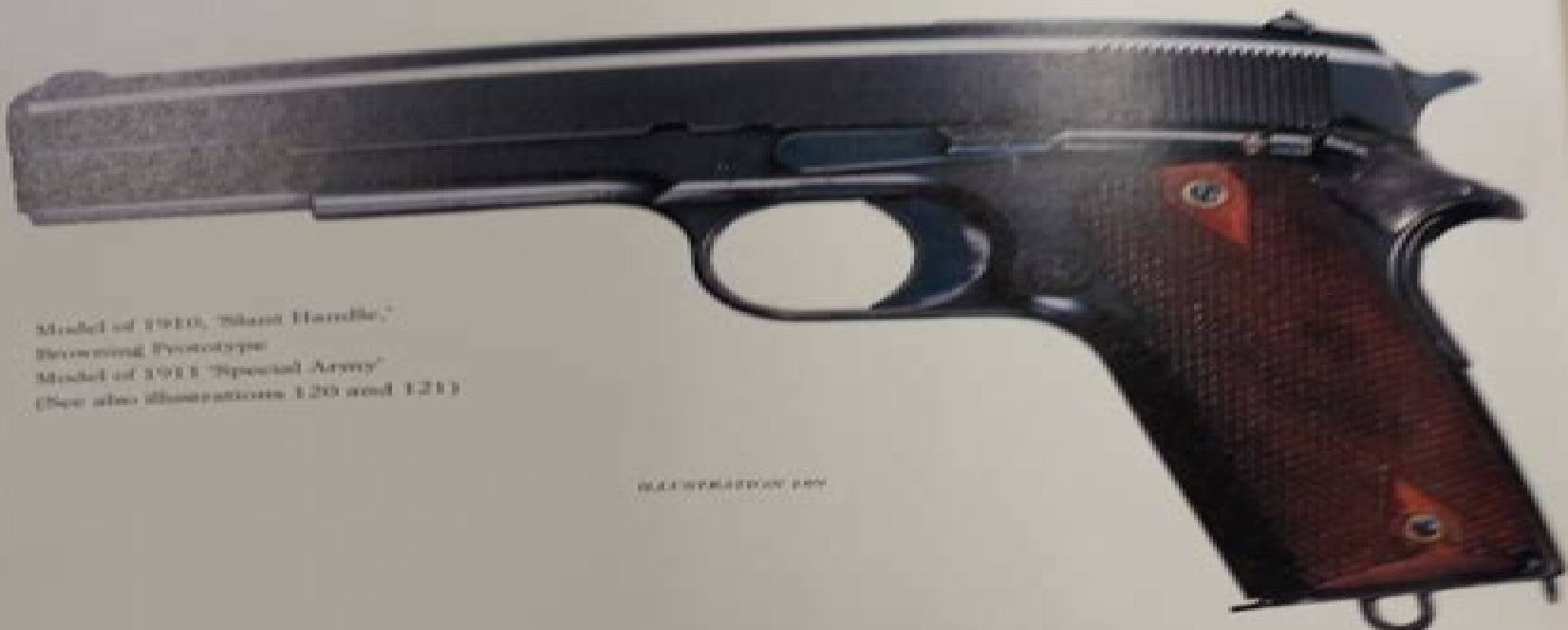
Model of 1910, "Shield Handle," Revolving Prototype Model of 1911 "Special Army" (See also illustrations 120 and 121)