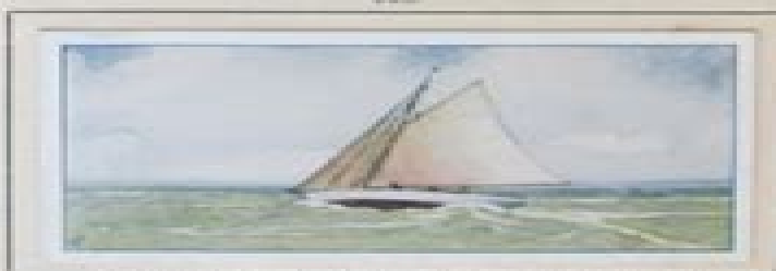
JACHT OP DE ZUIDERZEE VOOR ENKRUZEN.