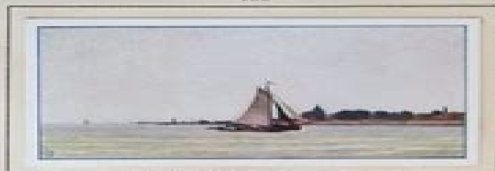
ENKRUZEN, VANDIT ZEE GEZIEN.