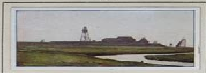
VUURTOEEN RIJ SURGERDAM.