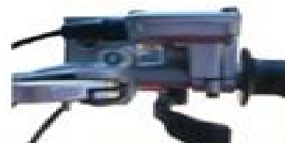
Throttle cable/ Front & rear brake lever pivot