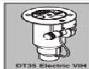
DT35 Electric Vih

Prior to installing the sprinkler, read through the recommended installation and start-up procedures. Please observe all WARNINGS and CAUTIONS when installing and operating this equipment.