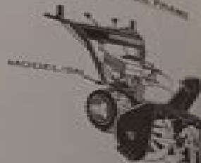
3 HP LARGE FRAME