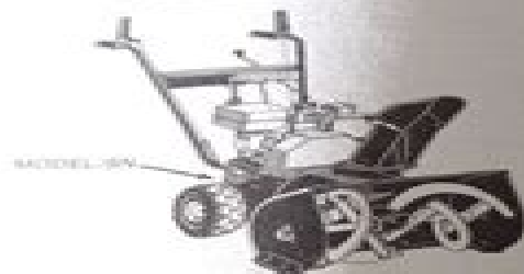
3 HP MID FRAME