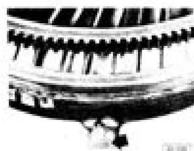
Converter code letter