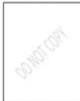
DO NOT COPY 1