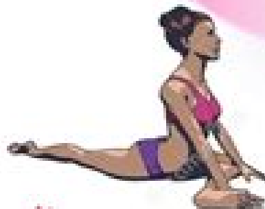
✿ Eka pada rajakapotasana