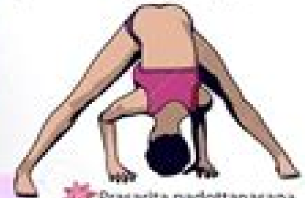
✿ Prasarita padottanasana