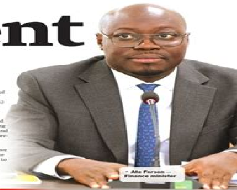
• Ato Forson — Finance minister