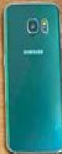
Galaxy S7 edge+