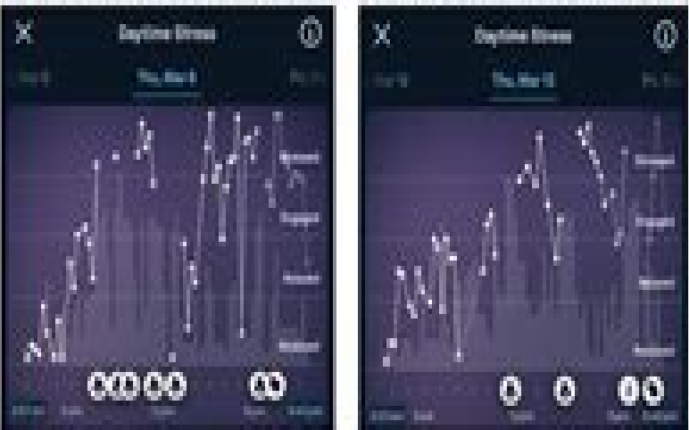
My Stress Levels Two Thursdays After The Change