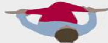
RECLINING COW FACE