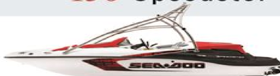
150 Speedster w/optional lower plate