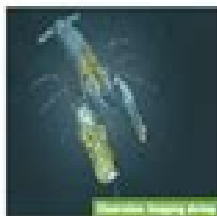
Snapping shrimp claw

Snapping shrimp have one claw longer than the other. The big claw snaps shut so fast that it creates a tiny jet of water.