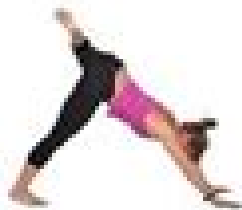
Knee circles (step 1)