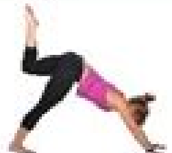
Knee circles (step 2)