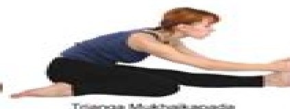
Trianga Mukhasikapada Paschimottasana

It relieves constipation, gripping pain in the stomach. It also strengthens the spine, neck, thighs and stomach.