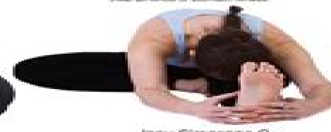
Janu Sirsasana C

This posture stimulates the digestive organs. It also releases lower back pain caused by muscular tension.