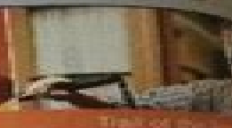
Trail of the Pony