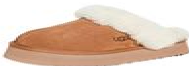
6. UGG SHEARLING SLIPPERS