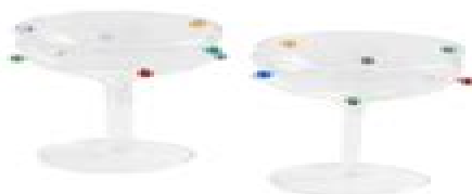
12. CHAMPAGNE COUPES