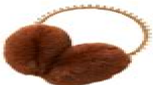
11. CRYSTAL EARMUFFS