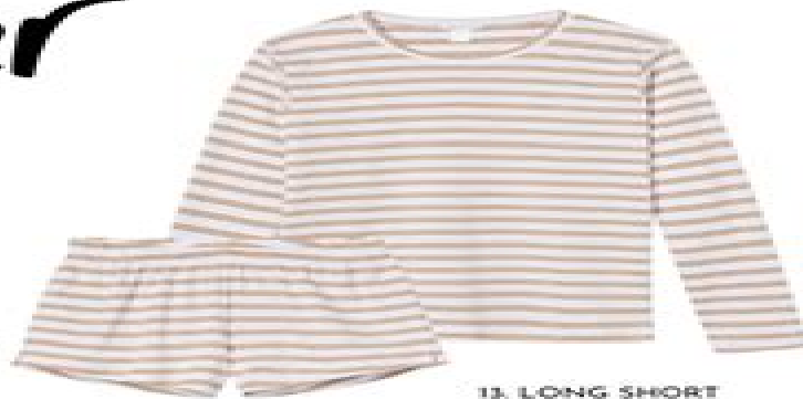
13. LONG SHORT PAJAMA SET