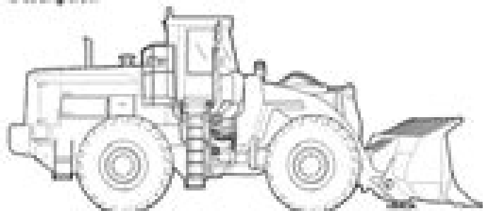
Figure 1 Wheel loader 1200

1200 is a two-wheel drive articulated wheel loader.