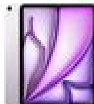
iPad Air (M3)