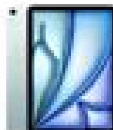
iPad Air (M3)