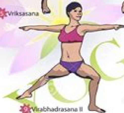
✿ Virabhadrasana II