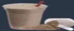
PROTEIN SHAKE 290 CALS / 39g P