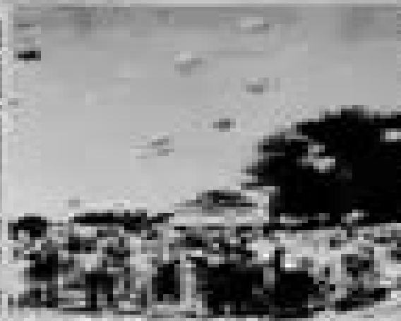
The group of people in the photograph above is part of a larger story or event being covered by the newspaper.