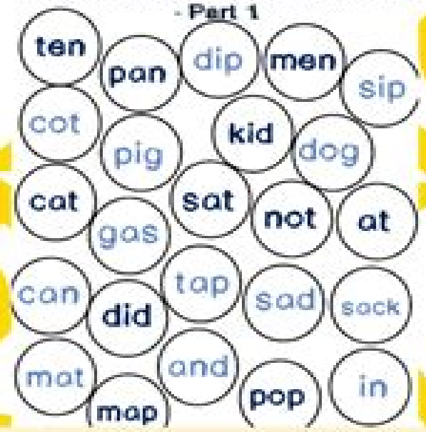
2. Flick the Eraser Phonics practice Game