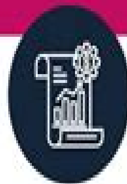
Income-Driven Repayment Plan