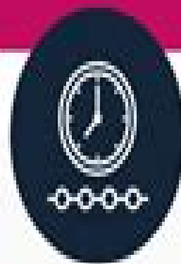
Extended Repayment Plan