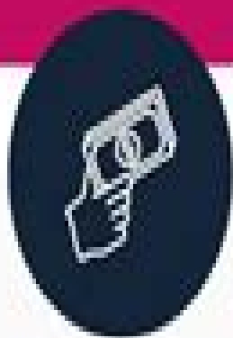
Standard Repayment Plan