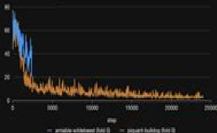
TRAIN BATCH LOSS