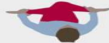
RECLINING COW FACE