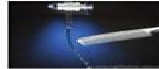
The charged comb attracts the column of water

When a charged object is brought close to an uncharged one the two objects attract each other