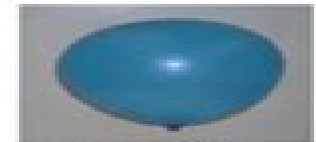
Charged balloon attracted to a wall