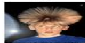
This boy's hair has all the same type of charge!