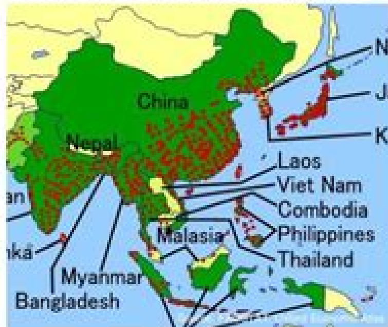
Distribution of rice producing area