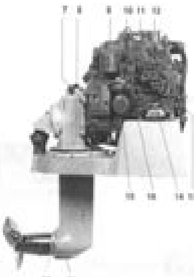
MD2010AB & MD20