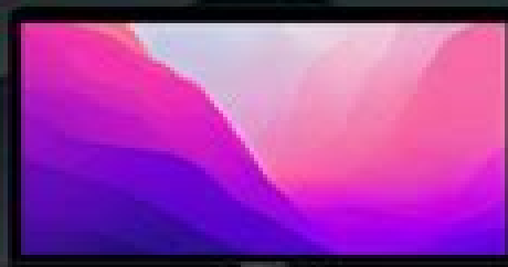
APPLE MACBOOK PRO M2