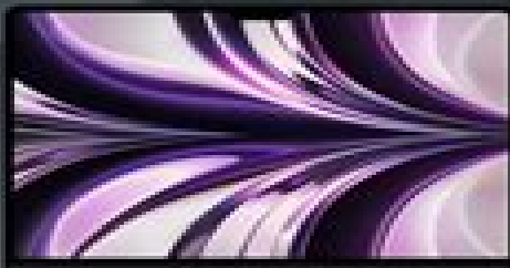
APPLE MACBOOK AIR M2

Use Coupon Code JN40 for AED 40 Extra Discount