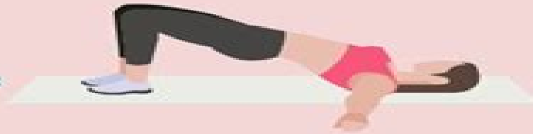
2. PILATES BRIDGE