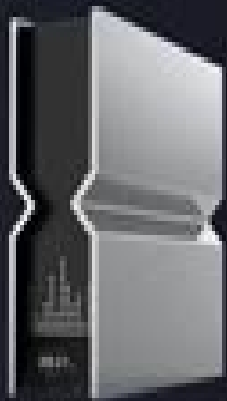
Wi-Fi 7 Routers