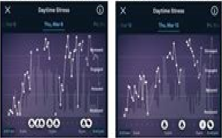
My Stress Levels Two Thursdays After The Change