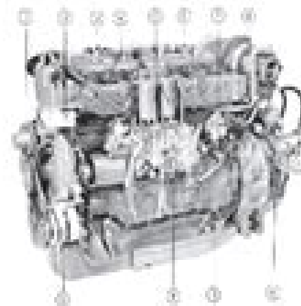
Fig. 4 Engine engine, TAMD60

The fuel system is well protected from interruptions during running by means of an electric, replaceable fuel filter. On the TAMD60 engines the fuel injection pump is large mounted under the other engine from the pump fitted on a bracket.