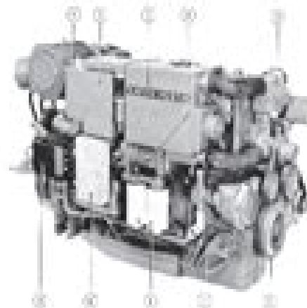
Fig. 3 Engine engine, TAMD60

The engines are fitted with a heat exchanger for thermodynamic, controlled fresh water cooling of the engine block, cylinder heads and exhaust manifold. The exhaust manifold cooling panel is designed so that it also cools at the exhaust ports.