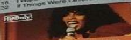
HBO Rocks Donna Summer