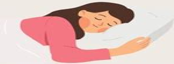
wake up mindfully