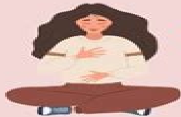
1. WARM-UP: PILATES BREATHING