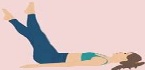
5. THE HUNDRED